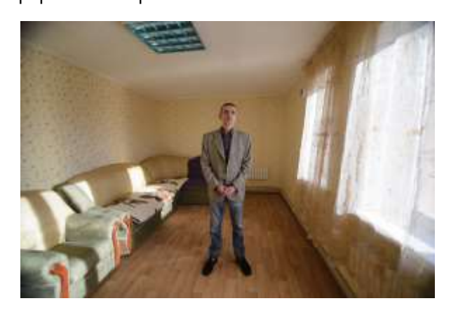
14. Eastern Center of Vocational Rehabilitation for People with Disabilities - Druzhkivka

The Center owns specialized training equipment for the disabled and has a room to install it (1st floor of a residential building). However, the room was in an unacceptable condition and was not accessible for people with disabilities. The rehabilitation allowed about 500 disabled people to use the Center and the equipment.