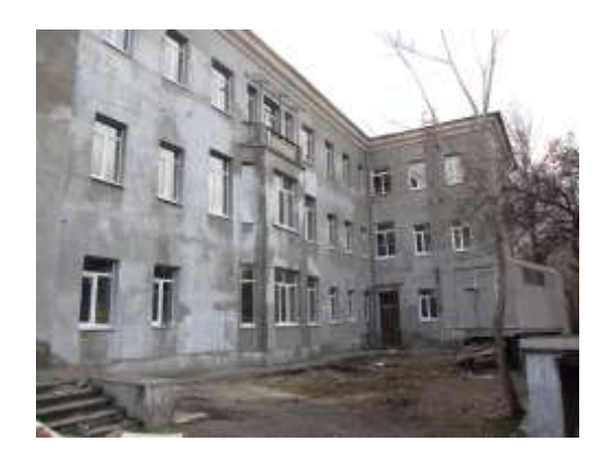
5. Kreminna Rayon Hospital - Kreminna

This hospital serves the population of Kreminna rayon (approx. 42,000 people) and IDPs (approx. 7,000). The premises were damaged and because of the leaking roofs could not function properly. The repair of the roofs and redecoration of rooms was needed. Because of this, the most vulnerable groups suffered the most: children and terminally ill people in respective departments of the hospital.