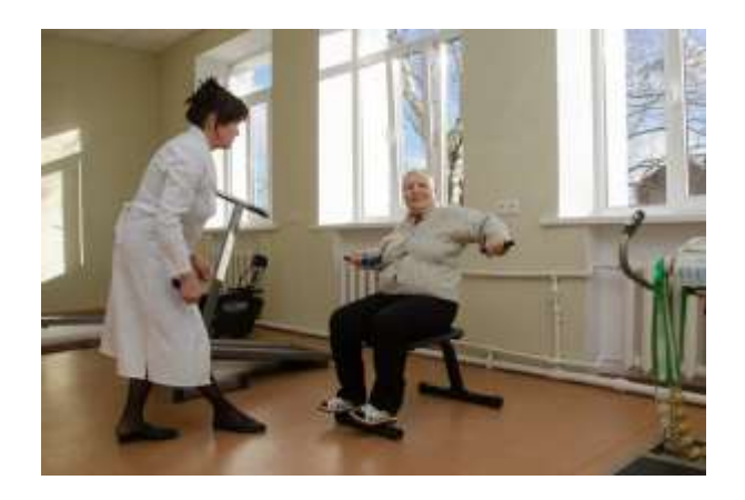
13. Center for Social Rehabilitation and Adaptation for Ex-prisoners and Ex-addicts (NGO "Tviy Shans") – Dobropillya

The Center serves the ex-prisoners, ex-addicts and others people who have problems with social adaptation. The Center ensures prevention of drug addiction, alcoholism, and adaptation to the society. The building has a second floor, which was not suitable for use due to its very poor condition. The repair of the second floor enabled provision of services to 30 more people and arranging of the workshop on a first floor.