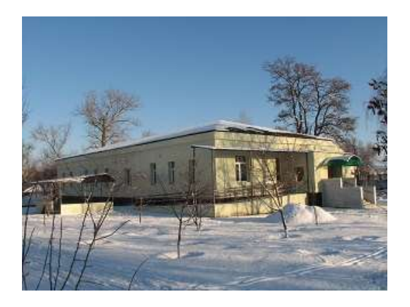
10. Kreminna Rayon Rehabilitation Center for Children with Disabilities - Kreminna

The Center provides rehabilitation care aimed at development and correction of disorders of the children with disabilities and their integration into society. The building is too small to cover all the needs and its condition was very poor. The only way to provide services of better quality was to demolish the old premise and build a new one. The completion of this project allows to increase the number of children covered by the services to up to 150 children per year.