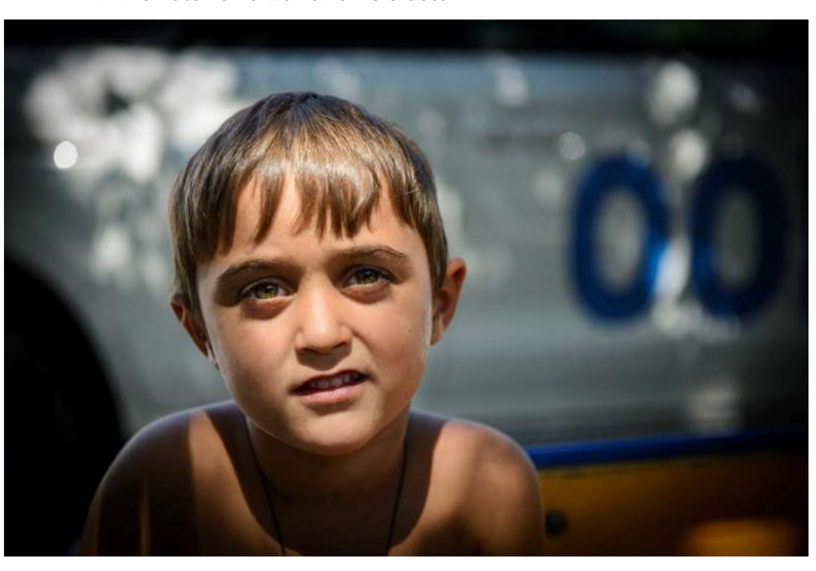
FINAL PROJECT REPORT January 2015 - April 2016