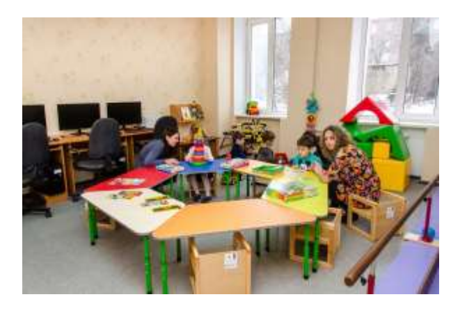
12. Territorial Center for Social Services - Bakhmut (Artemivsk)

Work Done: The Center provides social services to the elderly and disabled people and social and medical rehabilitation to people with disabilities. In addition, the local programs of social protection are delivered through this Center. Currently, the Center serves over 2,500 people a year. In order to improve the quality of social services, the facility needed significant rehabilitation.