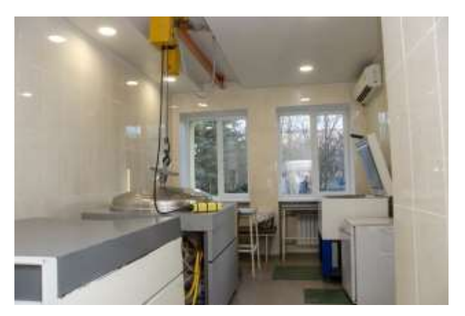
8. Donbas Interregional Center for Vocational Rehabilitation of People with Disabilities - Kramatorsk

The Center provides vocational education and social rehabilitation, social care and accommodation for people with disabilities. Due to the influx of IDPs, the Center needed repair of the 4<sup>th</sup> and 5<sup>th</sup> floors of the building and installation of elevators. Up to 250 people with disabilities are able to get improved access to services after the reconstruction.