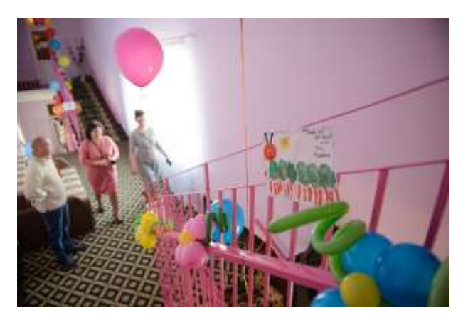
18. Ordzhonikidze Rayon Center of Social Services for Families, Children and Youth – Mariupol

The Center provides combined social services: a family center for 8,000 recipients per year and a humanitarian center that serves up to 15,000 people per year (most of them are IDPs). While being such a popular facility, the Center itself was not even a whole functioning building: only first floor was open, equipped and operational. The second floor was abandoned because of the ruined windows and heating system. The premises needed reconstruction to provide more space for social workers, improve functionality and energy efficiency of the building.