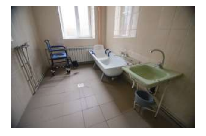
6. City Hospital No. 2 - Druzhkivka

Druzhkivka City Hospital No.2 is the only hospital that provides assistance to residents of the town (70,000) and surrounding villages (15,000 – 20,000 people). Windows and doors in the hospice and children departments were badly damaged and did not retain heat; minor repairs and sealing did not help. The condition and quality of the indoor premises was unsatisfactory.