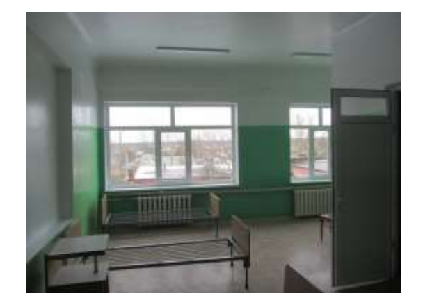
3. Lysychansk City Hospital named after Titov

This hospital serves the population of Lysychansk city (approx. 110,000 people) and IDPs (approx. 7,000). The roof and the top floor were damaged during the armed conflict. Roof leakage caused the fungus contamination of the premises. The entrance did not suit the needs of people with limited mobility.