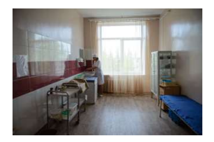
4. Luhansk Oblast Clinical Hospital (surgery) - Severodonetsk

The oblast hospital has remained at the territory which is not controlled by the Ukrainian Government. Thus, oblast residents lost access to the third level of medical care. 10 specialized surgical services can be provided to patients in the building of the former local clinic in Severodonetsk. The repair and an opening of an oblast hospital will allow to provide better medical care to 2.3 thousand patients annually and will restore the public access to the specialized medical care.